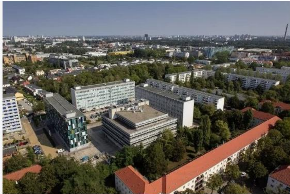
The original Stasi headquarters building

Keeping to the Brutalist architecture of the building, the interiors have an industrial chic attitude, featuring polished cement, stoneware tiles and exposed wall-mounted copper-housed cables.