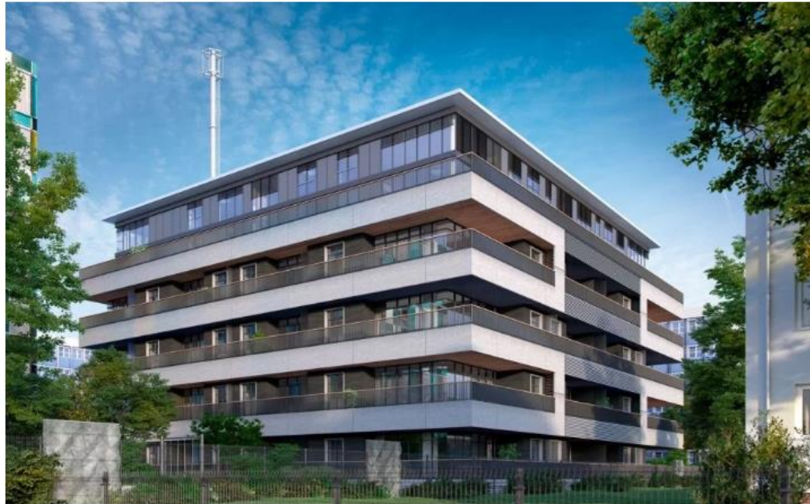
A CGI of the remodelled building